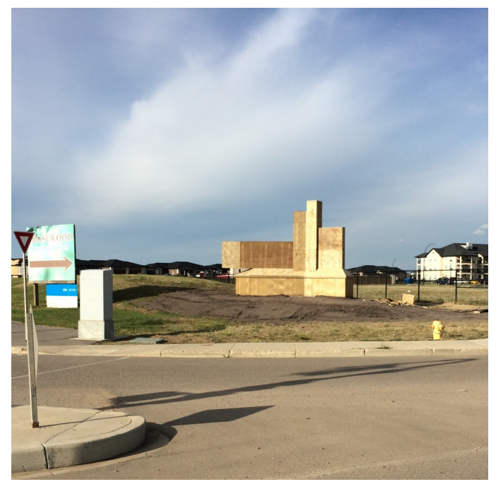
Rosewood entrance sign construction August 2015

The design phase is underway with the school set to be completed in 2017. This of course is subject to change. The name chosen for the Catholic School is St. Therese (of Lisieux) Catholic School. The Saskatoon School Board conducted a call for names and the most popular name was Rosewood Elementary School.