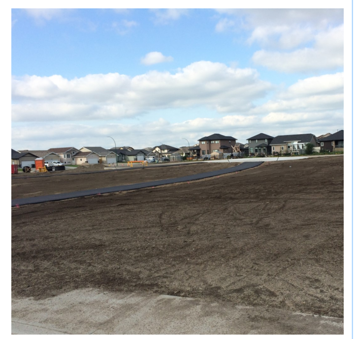
Swick Park construction August 2015

Although construction should be completed his year it will take some time for the grass and landscaping to fully establish.